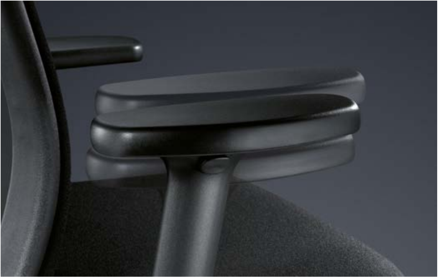
T-armrests, 4D adjustable in height, width and depth, rotatable.