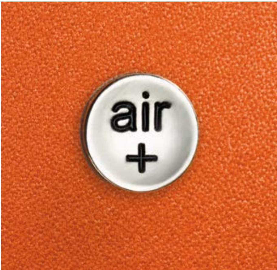
Height and depth adjustable air-pressure lumbar support in the upholstery design.