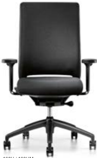
162H / 162HM

Hero is a collection of heroes, automatically aligned for everyone. Heavy, light, big and small people. By and large, a universal talent for everyday heroes. It has invisible technology which is an integral feature of the chair. Hero focuses on each owner individually, regulating its weight, as a result of its unique autofit-synchronous mechanism. From approx. 45 - 120 kg, everyone can fine-tune it how they want. From athletically hard to relaxingly soft, everyone's personal taste is catered for. As perceptive as Hero seems, it is present in its slim-line form. It looks agile and athletic with its slimline figure.