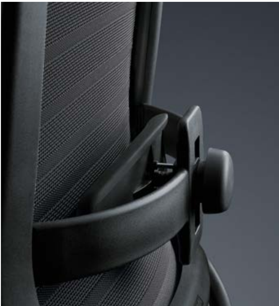
Height and depth adjustable mechanical lumbar support in the mesh design.